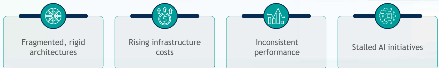
Figure 4: The risks of delay in action

The mandate is clear - Reimagine the network as an intelligent, scalable, and secure foundation for AI.