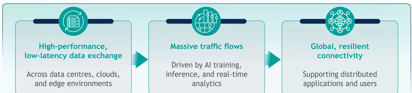
Figure 1: AI-driven enterprises demand a new class of connectivity

This requires enterprises to transition to a next-generation network architecture that is intelligent, adaptive, and secure by design, enabling dynamic workload awareness, automation, unified visibility, multi-cloud and multi-data centre abstraction, and embedded security and sovereignty by design.